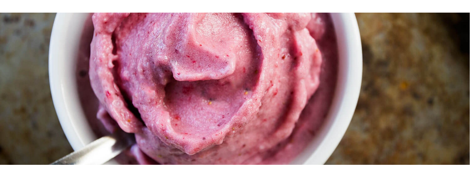
Strawberry Banana Ice Cream